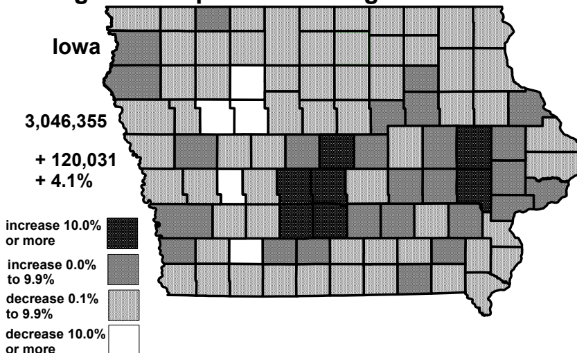
Figure 1. Population Change 2000 - 2010

In recent decades, significant numbers of counties have registered a population decline at a census. Between 1990 and 2000, 45 counties experienced a population loss while 54 showed a gain. The decade of 1980 to 1990 was especially hard on Iowa's population. During that time, Iowa lost 4.7 percent of its residents (-137,000) with 92 counties showing population loss (Figure 2).